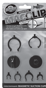
Mag Clip Item# MS-1