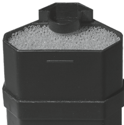
PART #6 ATTACHED